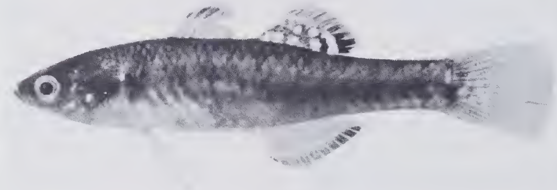
Figure 2 Hypseleotris compressa , female, 29 mm SL, Prince Regent River, Western Australia.

Two to five preopercular pores. Adults usually with two pores connected by short tube above dorsoposterior margin of eye. Predorsal scales reach forward to above middle of eye; cycloid or ctenoid. Cheek with four to six rows of small embedded cycloid scales. Operculum with medium-sized cycloid scales. Gill opening extends forward to below posterior preopercular margin. First dorsal VI. Second dorsal I,9-10. Anal usually I,10-11. Typically with 1 or 2 more anal than dorsal rays. Pectoral usually 14-15. Longitudinal scale count 25-29. Predorsal scales 14-18. Transverse scales (TRDB) 9-10. Postdorsal scales 8-9. Gill rakers on outer face of first arch 3-4+1+19-11 + 12-16. Vertebrae 26. Sides of body often with about 7 or 8 brown vertical bars, often forming X-shaped marks on midside. Base of caudal fin with a vertically elongate dark brown spot just below midside. Dorsal fins with 2 black stripes. Second dorsal with round white spots posteriorly, surrounded by black. Live and fresh adult specimens viewed from above usually have a distinct dark mark near the posterior end of the second dorsal fin.